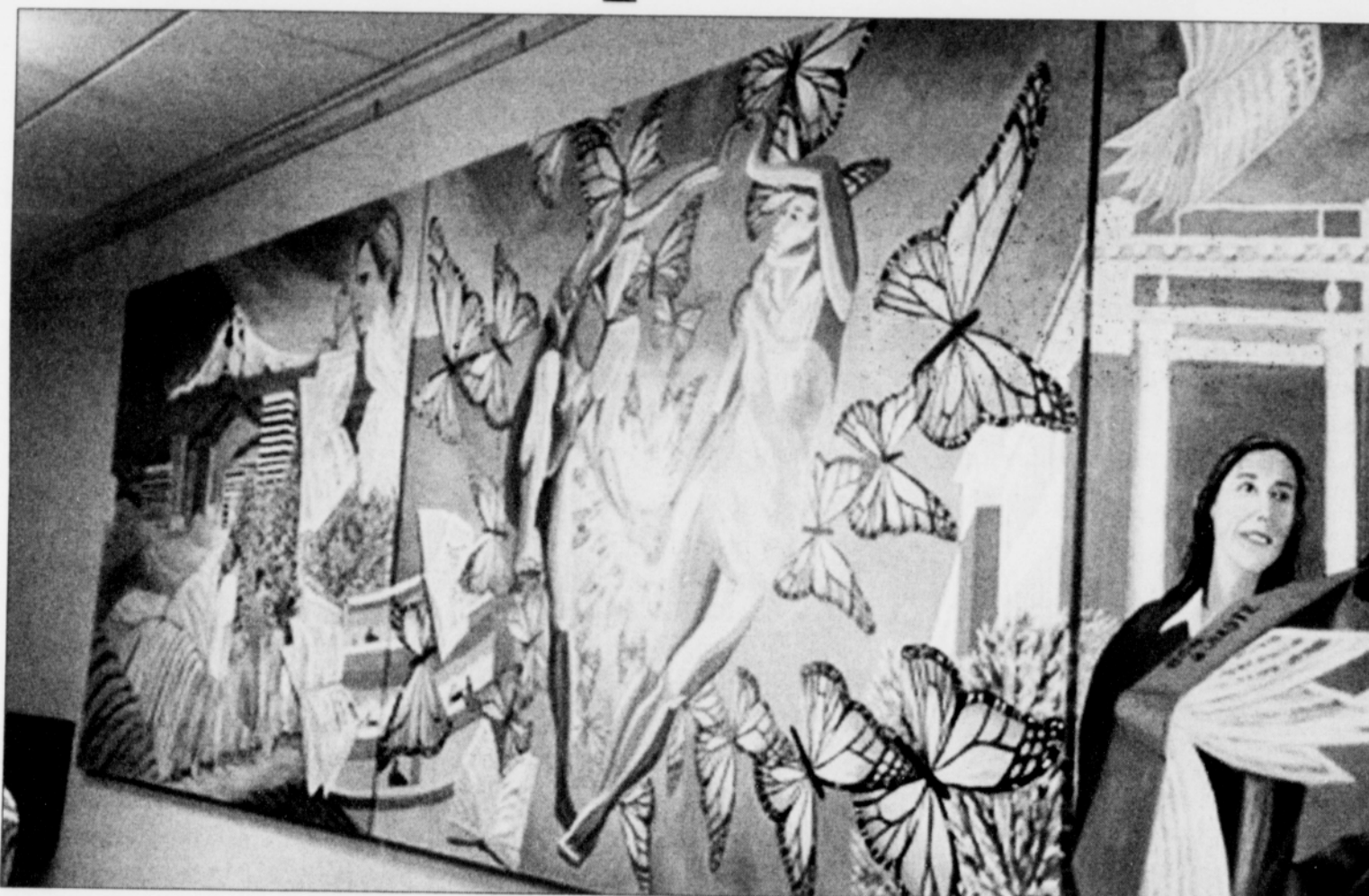
A three-panel mural designed by student artists depicts Latinos progressing from migrant labor to college life and academic success at the new 'La Casa Latina,' at Portland State University.

but it's only a visual manifestation of the many programs we're promoting for Latino success,"