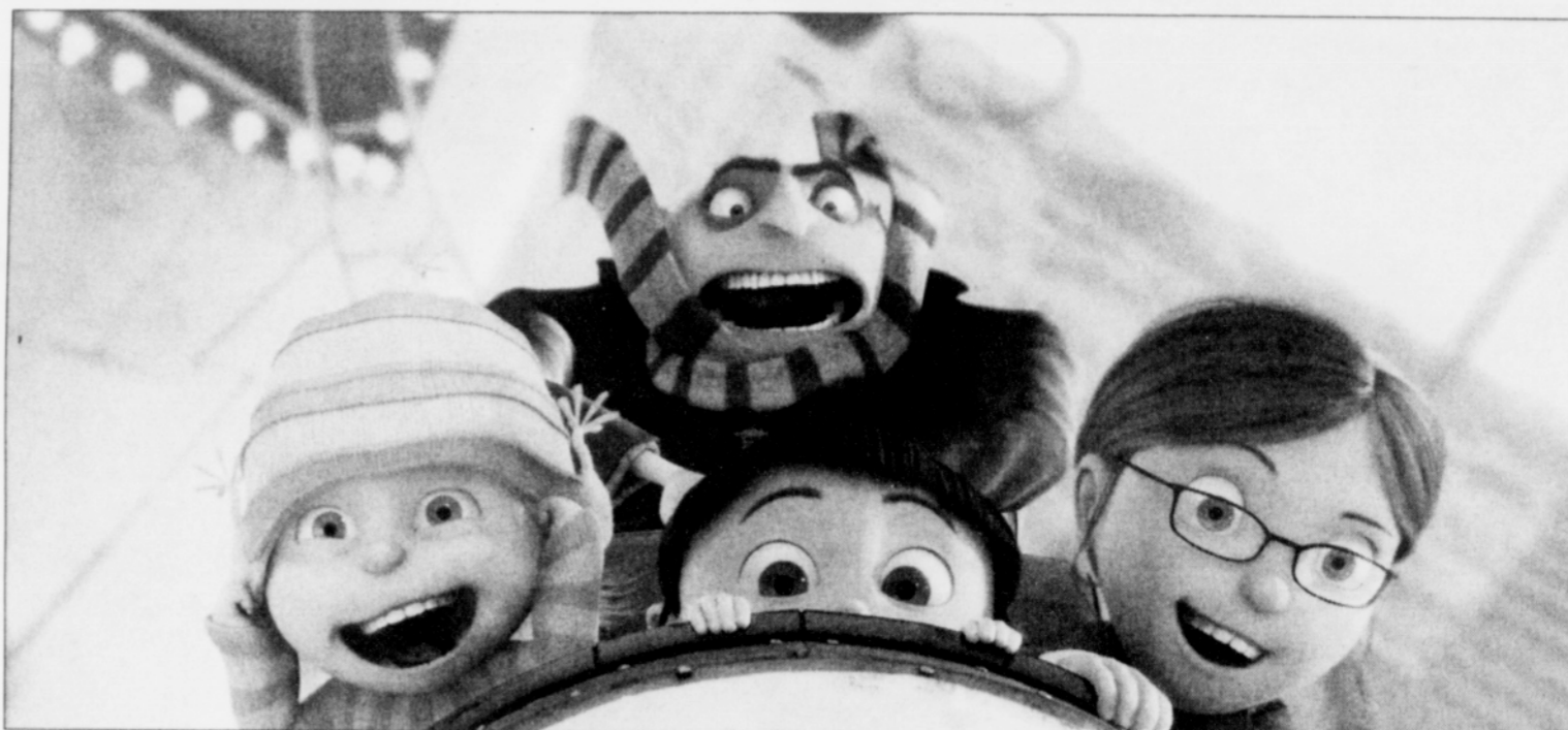
When a criminal mastermind uses a trio of orphan girls as pawns for a grand scheme, he finds their love is profoundly changing him for the better in 'Despicable Me.' The film will show Sunday, June 26 at Peninsula Park in north Portland as the first movie of Portland Park and Recreation's 'Movies in the Park' summer schedule.

For more information on how to register for swimming lessons or participate in other summer activities, contact the pool in your area or the Aquatic Administration Office at 503-823-5130.