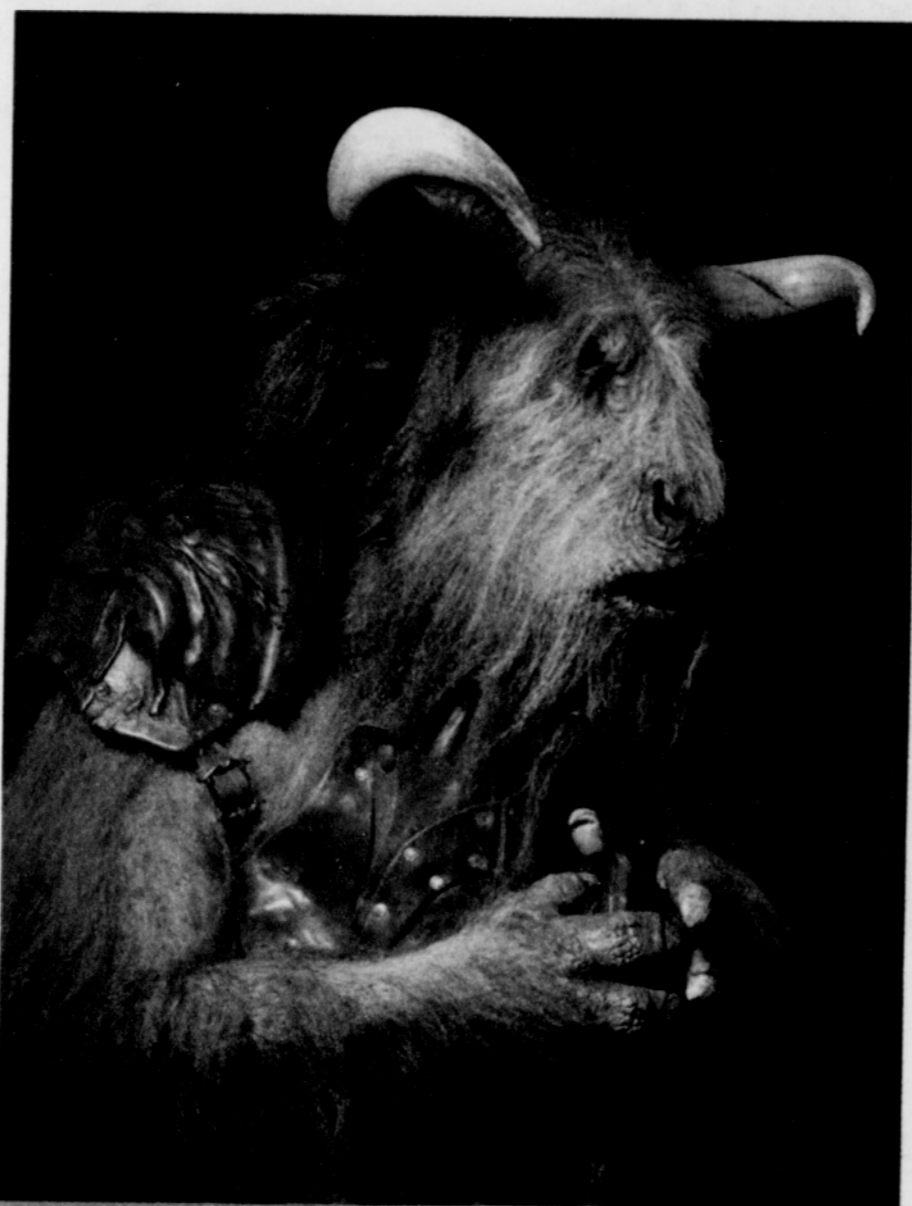
A life size display of Asterius from the Chronicles of Narnia: The Exhibition, now showing at the Oregon Museum of Science and Industry (OMSI).

Original props and costumes from all three films, in addition to multi-media presentations, hands-on elements and interactive activities, will launch visitors into a