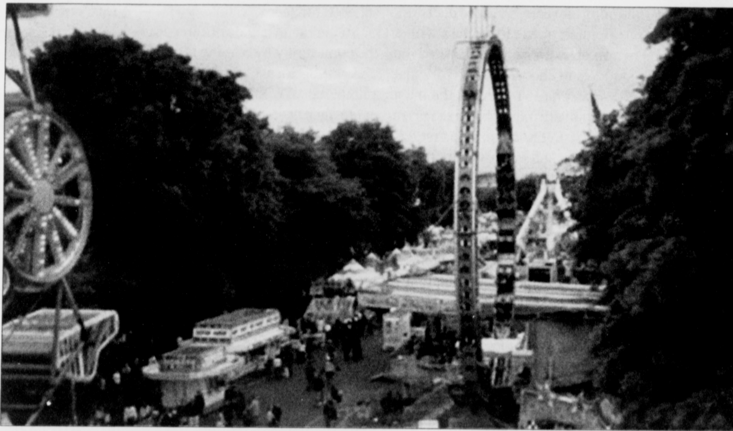
Waterfront Park, downtown, will turn into CityFair this weekend as the annual Rose Festival opens for carnival rides, entertainment, food and other featured events.

Other fun features include happy hour specials, the Big Sling—the thrilling human catapult, a live animal exhibit by KOIN 6 News, festival foods at the culinary courtyard, and a variety of performances on the Dex Grand Wheel Stage.