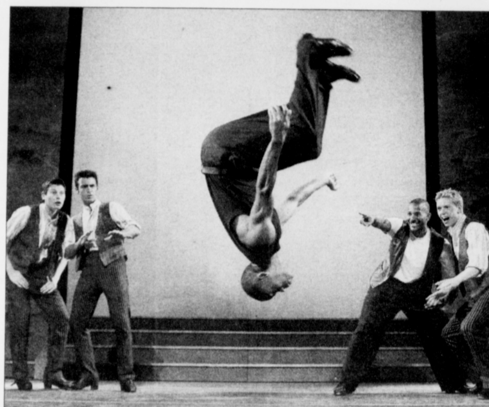
The thunderous celebration of Irish music with an international cast of performers comes to Portland with Riverdance.

Whether it's your first time or fifth, you won't want to miss these farewell performances of Riverdance!