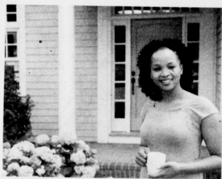
the "I can't believe it's mine" home