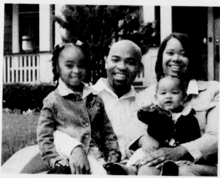
the "make room for more" home