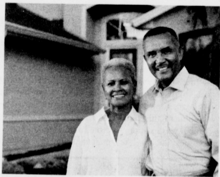
the "you and me at last" home

The perfect mortgage from us will make you feel right at home.