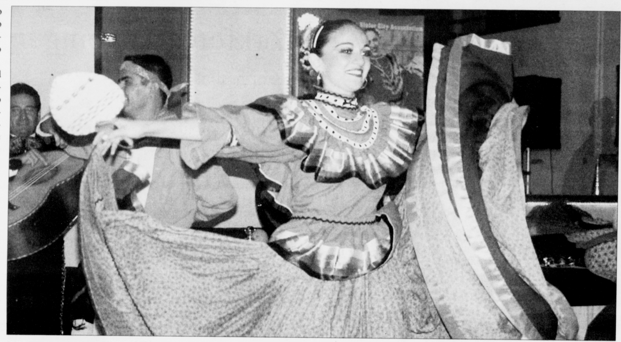
Latino culture is celebrated on three stages during the annual Cinco de Mayo Fiesta on the downtown waterfront.

You can also visit any O'Reilly Auto parts Store to get a 50 percent off admission coupon.