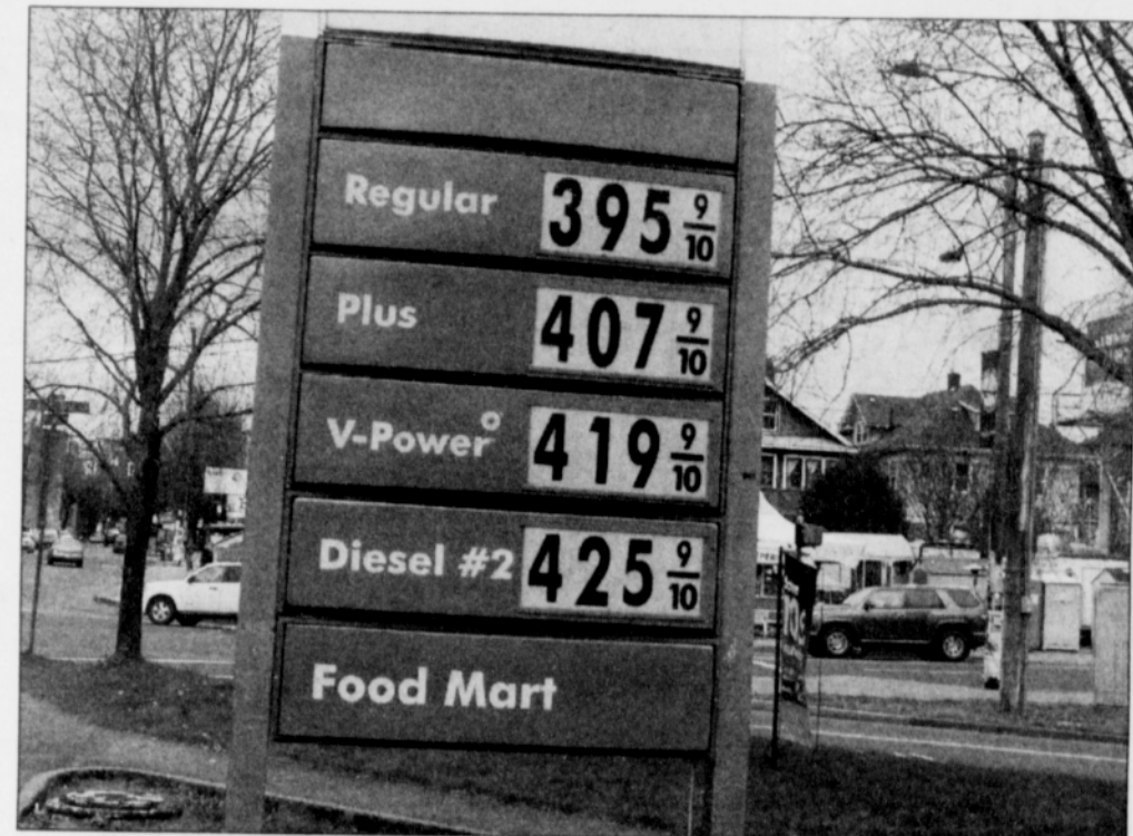
The regular price of a gallon of gasoline nears the $4 mark at the Shell Food Mart at Northeast Broadway and Martin Luther King Jr. Boulevard. Plus and other premium fuels were over $4 a gallon.

AAA says pump prices have also been on the rise due to the annual change from winter-blend to the more expensive summerblend gasoline.