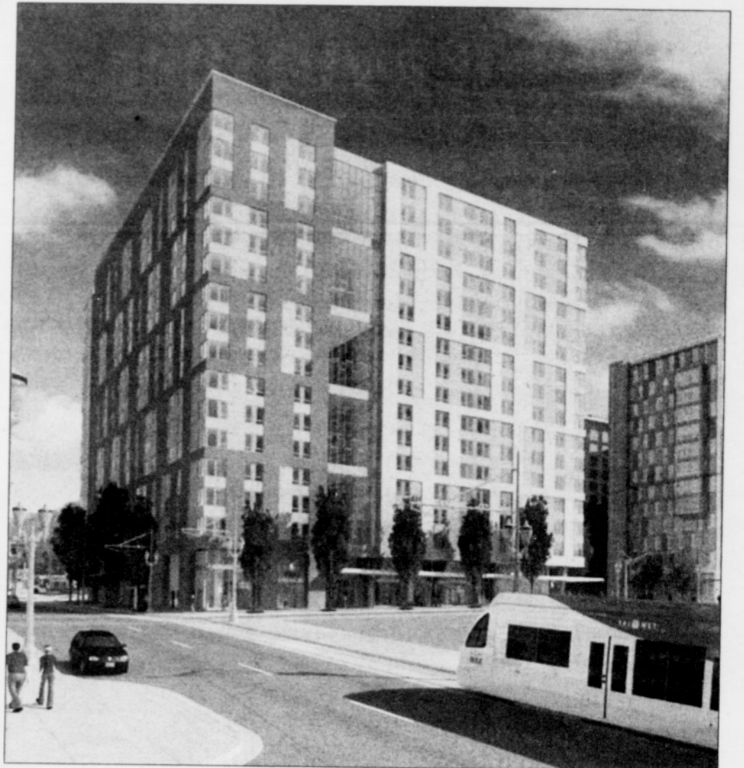
An artist's rendering shows College Station at Portland State University which will house nearly 1,000 students upon completion in Fall 2012.

American Campus Communities, a Texas real estate firm, amazingly comes at a time when Oregon, and the region are reeling from a recession and state services are facing budget cuts.