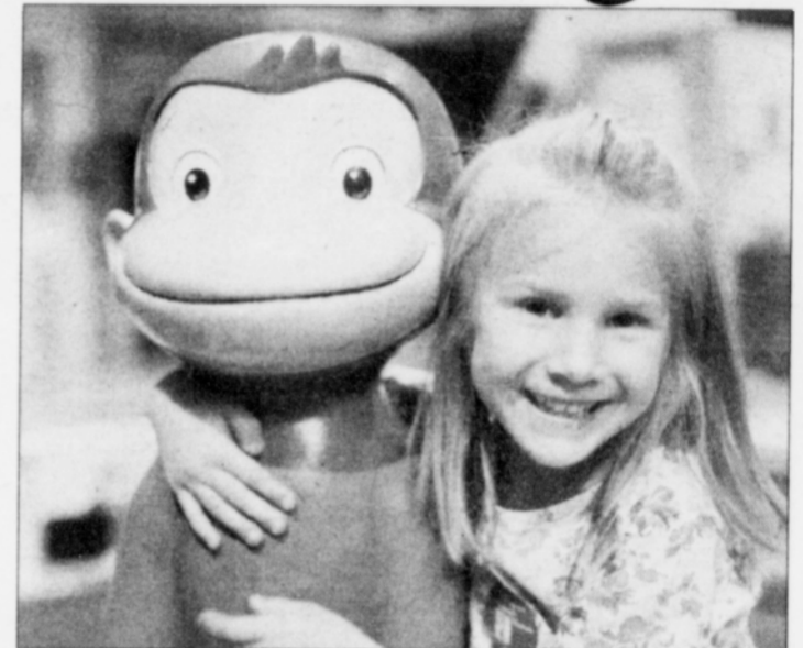
Curious George has hugs and high-fives for kids at the Portland Children's Museum.

Curious George: Let's Get Curious! continues through June 5 at Portland Children's Museum, 4015 S.W. Canyon Rd., next to the Oregon Zoo.