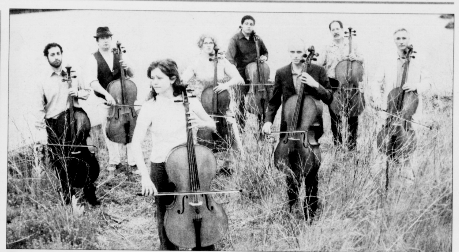
The Portland Cello Project is an ensemble of local musicians who are dedicated to forming partnerships to build a stronger music community. Members of the group will perform a family concert, March 11 at the Community Music Center, 3350 S.E. Francis St.

The documentary will be shown on Saturday, March 12 at 7 p.m. A $2 donation will be accepted at the door and everyone is welcome. A Latin American buffet, with vegetarian option, will be available at 6 p.m. for a $7 donation.