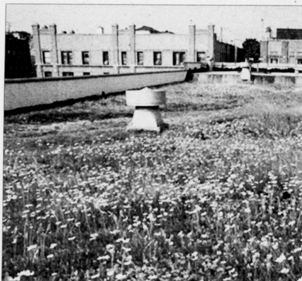
Leaders worldwide are recognizing the benefits of green roofing.

The Bureau of Environmental Services provides city residents with