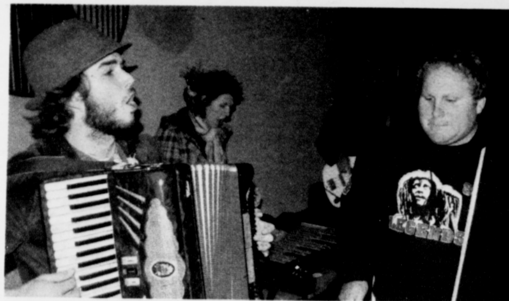
The Portland band 'All the Apparatus' plays to the crowd during a Last Thursday celebration last year.

Key.com is a federally registered service mark of KeyCorp. ©2011 KeyCorp. KeyBank is Member FDIC. ADL2787