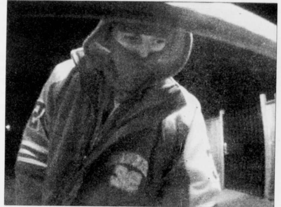
Police released this security camera photograph of a man wanted in connection with three armed robberies of the Wells Fargo ATM on Northeast 42nd Avenue and Going Street.

Anyone with information is urged to call police at 503-823-4357.