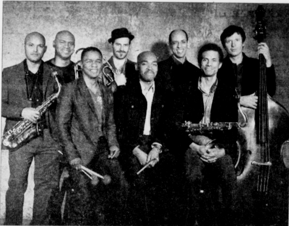
SFJAZZ Collective and Joshua Redman are set to perform this weekend at the Alaska Airlines/Horizon Air Portland Jazz Festival Presented by US Bank.