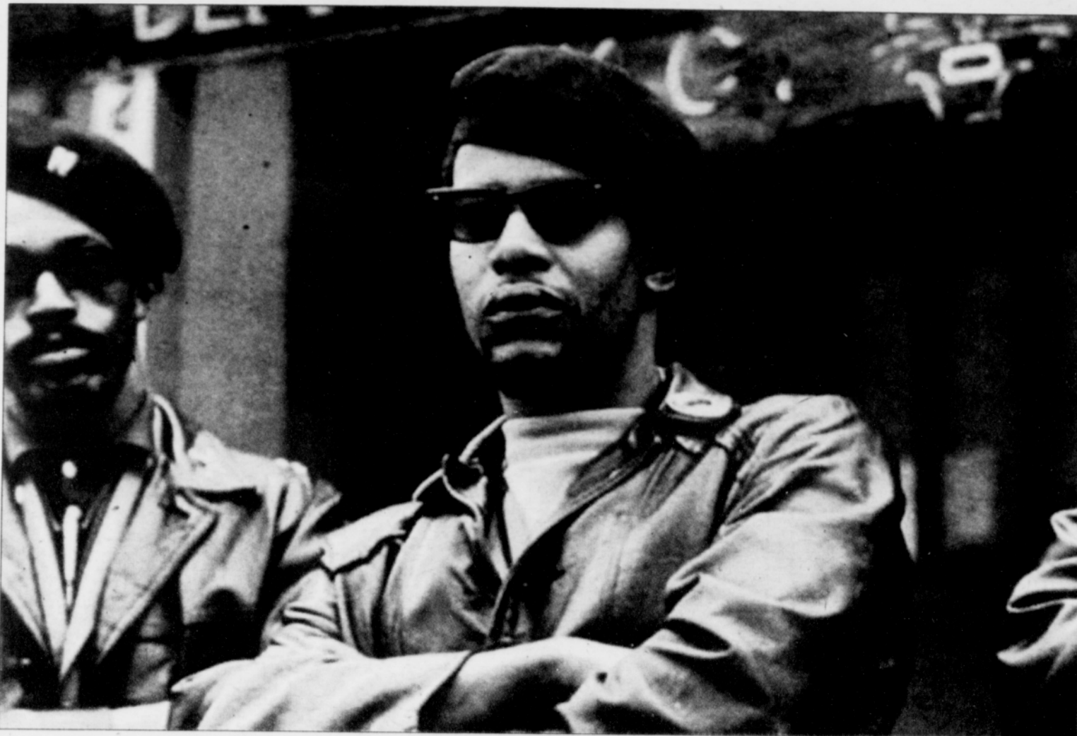
Pete O'Neal as a Black Panther in 1970.