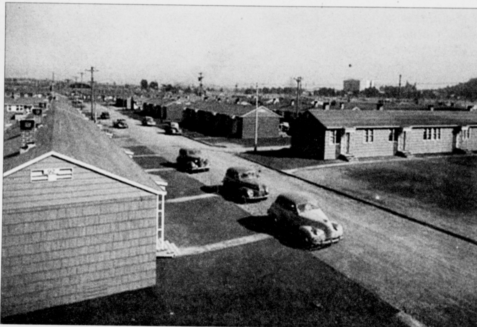
World War II housing at Guild's Lake in northwest Portland was one of the few residential developments of the era made open to African Americans.