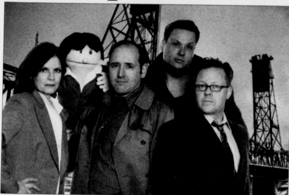
The Unscriptables bring improvised theater to a new level with Lawful Order: Special Puppet Unit , now playing in the Unscriptables studio at 1121 N. Loring St.

The Unscriptables are here to clean up Portland's stages and put the perps behind bars. The cast from this local improvised theater company has puppets and humans working side by side to solve the