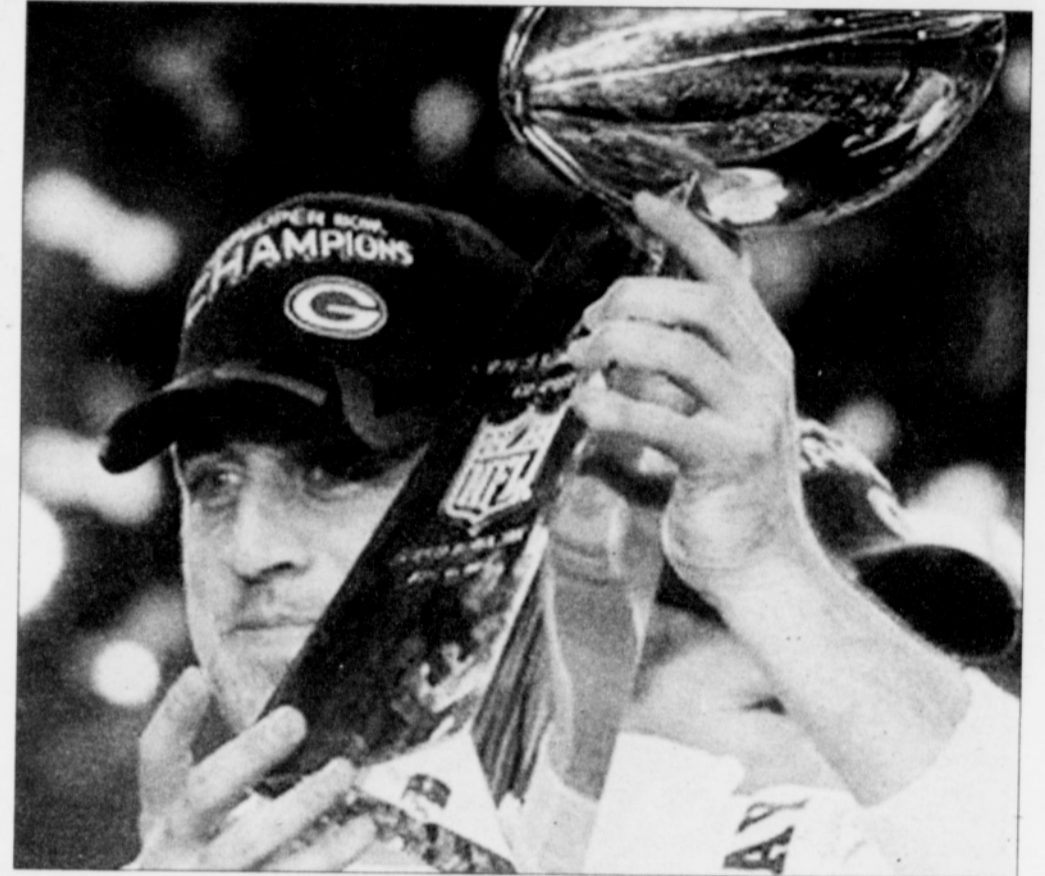
Green Bay Packers' Aaron Rodgers holds the Vince Lombardi Trophy after the Packers' 31-25 win over the Pittsburgh Steelers in the NFL Super Bowl XLV football game.