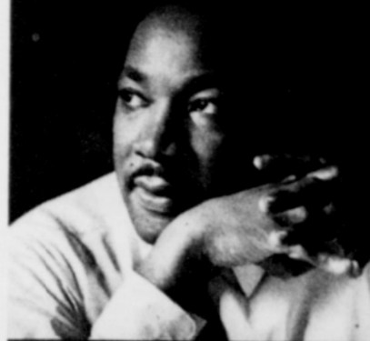
REV. MARTIN LUTHER KING