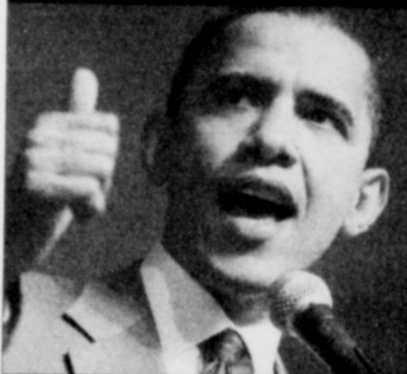
PRESIDENT BARACK OBAMA