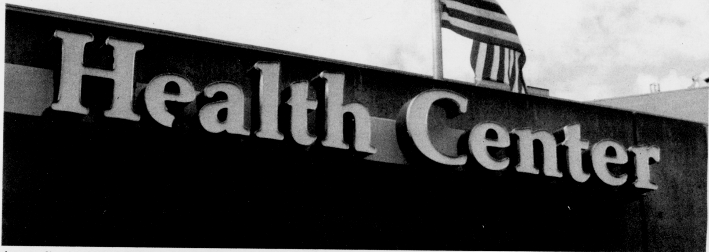
A group of local and national activists are promoting a single-payer and universal healthcare system that goes beyond President Obama's health care reforms.