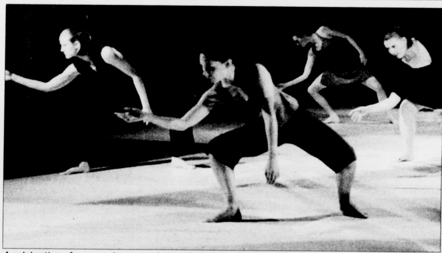
A celebration of women choreographers culminates with the world premiere of visionary Portland choreographer Mary Oslund's 'Childhood Star.'