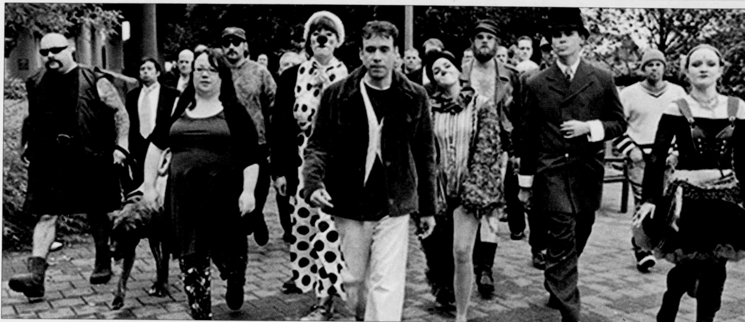
Cast members from the new Cable TV show 'Portlandia' during a scene in Tom McCall Waterfront Park, downtown. The premiere episode airs on Friday, Jan. 21 at 10:30 p.m. on Comcast Channel 503 and Dish Channel 131.