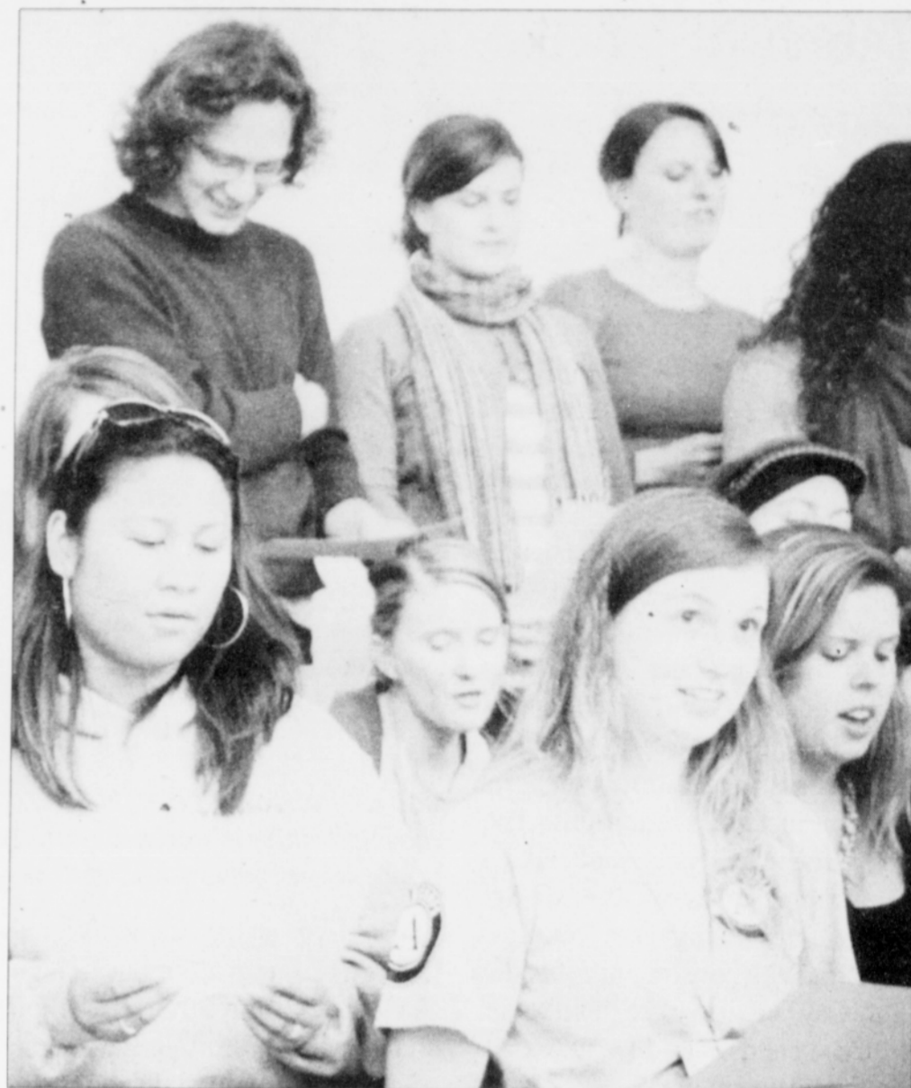
Volunteers from throughout Oregon come together in Portland to collectively recite the AmeriCorps pledge during a day of training and inspiration. AmeriCorps joins the group Oregon Volunteers to remember Dr. Martin Luther King Jr.'s life and legacy and to honor him by taking action to solve problems in their communities.

"Oregon values the same principles Martin Luther King de-