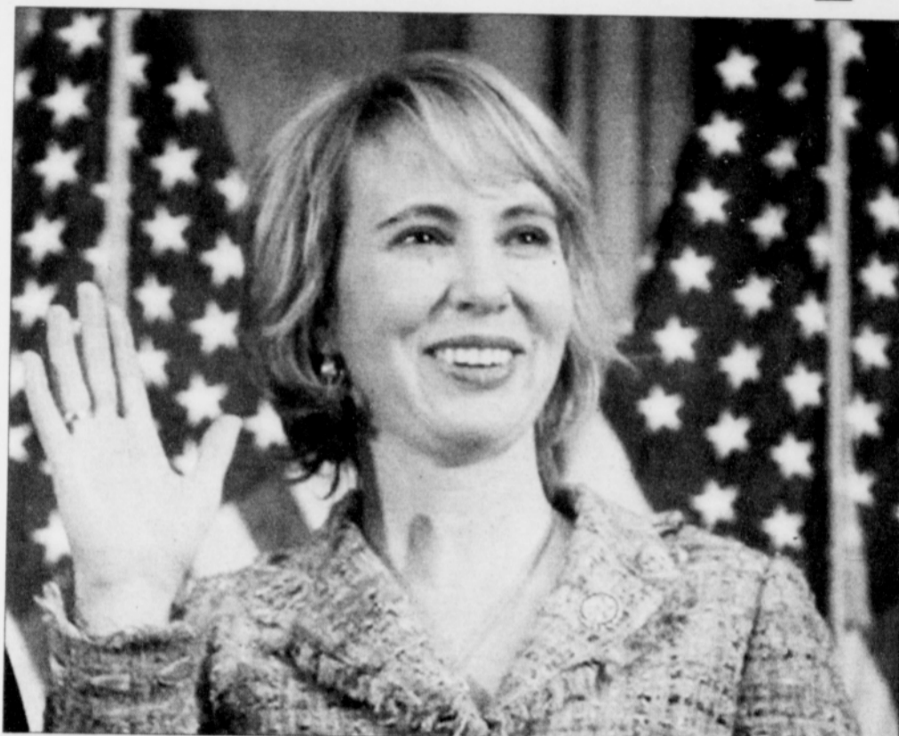
A photo of U.S. Rep. Gabrielle Giffords before Saturday's assassination attempt outside a Safeway store in Tucson, Ariz., where she was meeting with her constituents. Six other people, including a federal judge were killed and 14 others were injured in the attack.

The nation got its first look on Monday at the 22-year-old loner