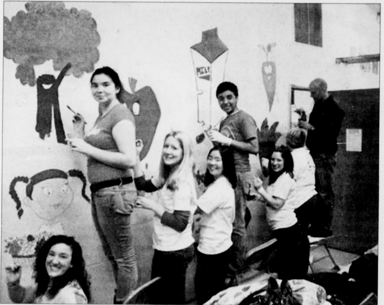
Local students paint during a previous Martin Luther King Jr. Day of Service.

Day of Service on the Martin Luther King Jr. holiday on Monday, Jan. 17.