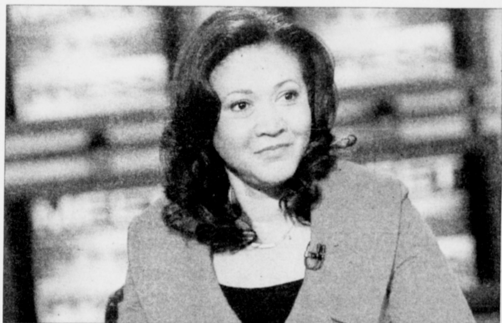
Michele Norris, host of NPR's All Things Considered.

Later Friday at 6 p.m., "In the Mix: Student Performances" will profile and showcase the hidden or unknown talents of PSU students in the performing arts. Social justice messaging will punctuate the array of spoken word deliveries, musical renditions, small street theater dance, and songs in the key of life.