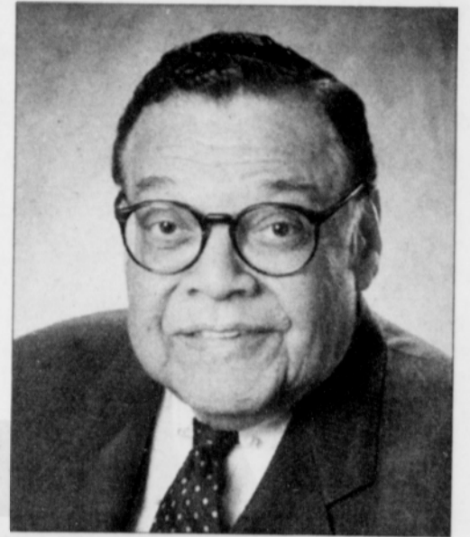
William T. Coleman