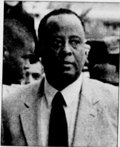
Dr. Conrad Murray