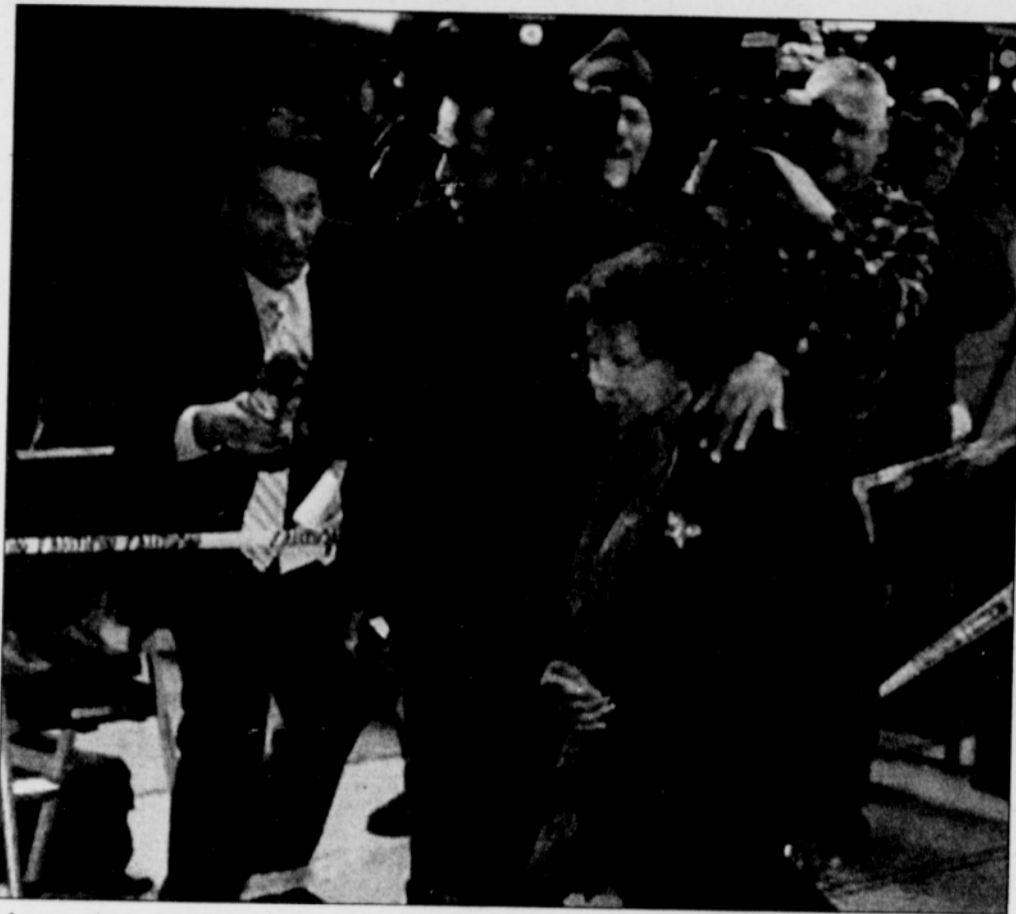
Jermaine Jackson and Katherine Jackson arrive for the preliminary hearing Tuesday for Dr. Conrad Murray in Los Angeles.