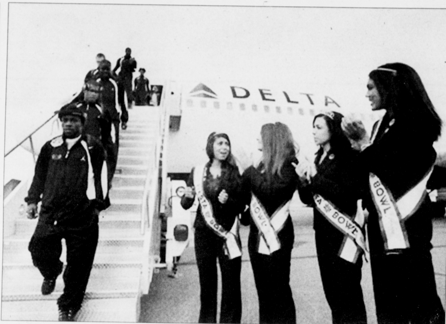
Oregon players are greeted by the BCS championship game queen and her court at Sky Harbor International Airport on Sunday in Phoenix, Ariz. Oregon is scheduled to face Auburn in the championship game Jan. 10 in Glendale, Ariz.

Portland: (503) 491-5156 Hillsboro: (503) 615-0425 Facsimile: (503) 244-2084 Email: Sweeney@PDXLawyer.com