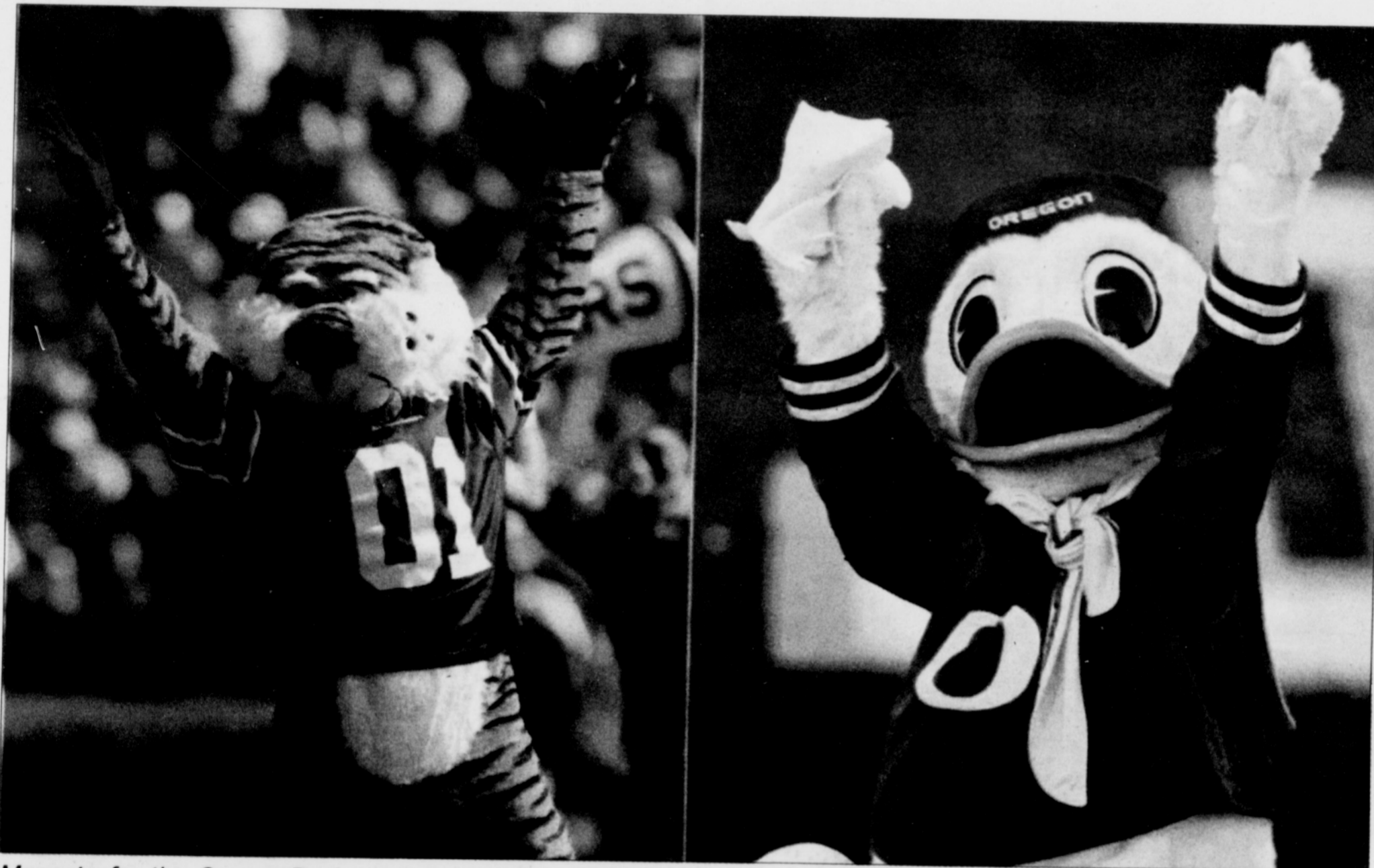
Mascots for the Oregon Ducks and Auburn Tigers set the stage for the NCAA college football title. The BCS championship game is scheduled to air on ESPN on Monday, Jan. 10 at 5:30 p.m. A special free broadcast will also take place at the Hollywood Theater on Northeast Sandy Boulevard.