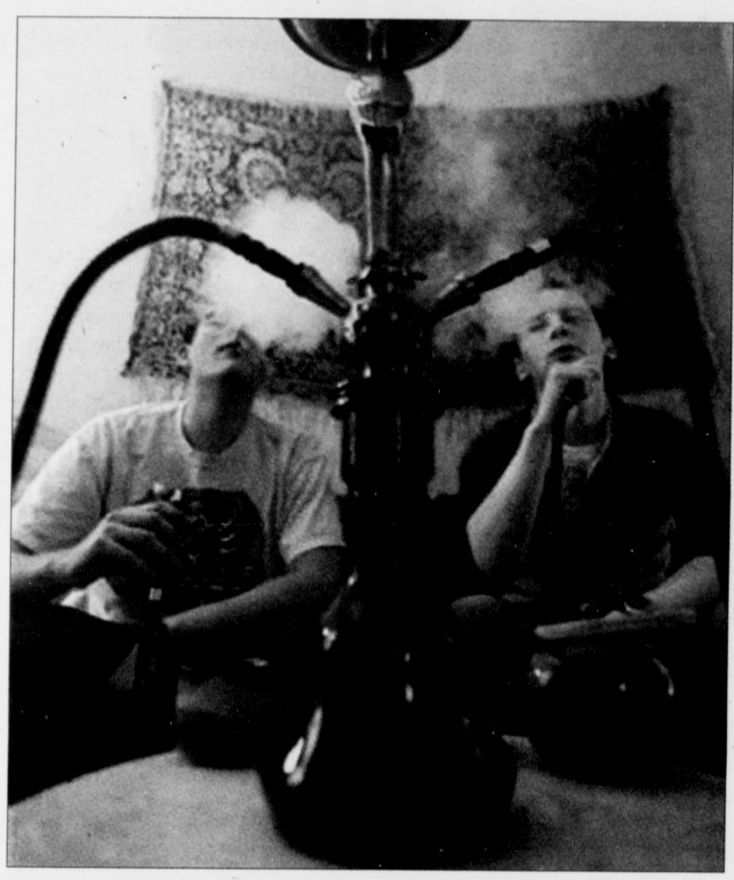
young people is putting us in a Hookah lounges that use exotic pipes to burn tobacco are a growing health concern because Hookah smoke contains dangerback situation in the battle against ous levels of cancer-causing chemicals and toxic gases.

Hookah tobacco – or shisha – is addictive, contains nicotine and can cause lung cancer, heart disease and other complications, just like cigarettes. Burning char- at worst.