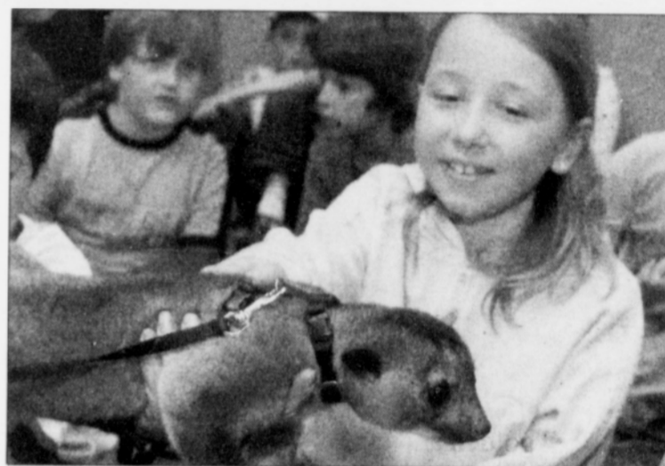
Kids can get a close-up look at a touchable animal such as a kinkajou during the Oregon Zoo's New Year's Eve overnight.