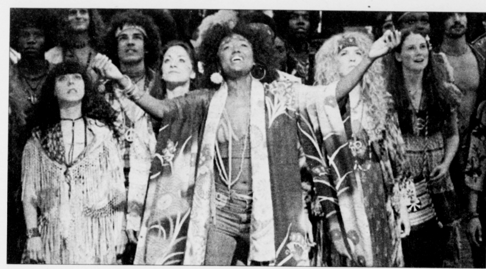
The smash Broadway revival of 'Hair,' comes to Keller Auditorium, Tuesday, Dec. 28 through Sunday, Jan. 2.