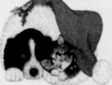
First time clients receive $5 off first groom

503-283-1177 Hours: 9:00 am-7:00 pm Tuesday-Saturday