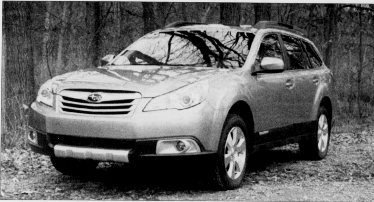
Tested Vehicle Information: 3.6L Horizontally-Opposed-6 Cyl Engine; 5-Speed Auto Transmission with Manual Mode; 18 City MPG, 25 Highway MPG; MSRP$32,220, Tested Vehicle Price $33724.