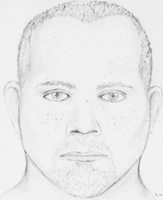
A police sketch shows a suspect wanted for a hate crime.

as a white male in his early to late 20s. He is approximately 6 foot 1 with a muscular build. He had short