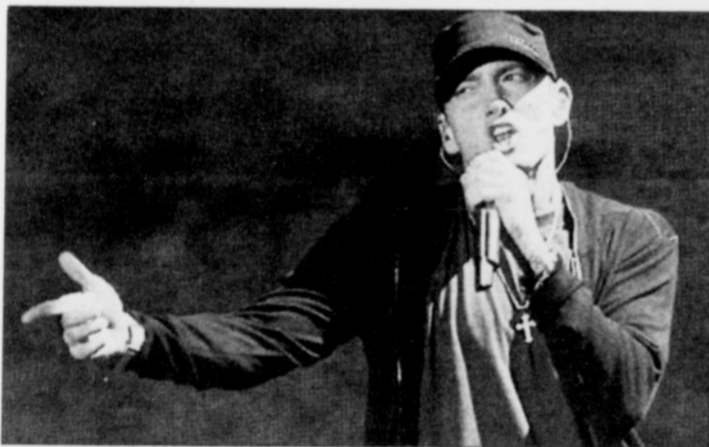
Eminem has been nominated for album of the year, some 10 years after his first album of the year nomination.

Last week, the Recording Academy once again nominated Eminem for album of the year along with nine other bids; and it again gave accolades to a foul but genius piece of work—CeeLo's "(Expletive) You,"