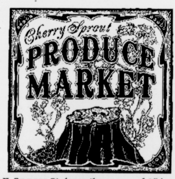
722 N. Sumner St. (near the corner of Albina & Sumner) Mon-Sat 9am-8pm Sun 10am-7pm.

THANKSGIVING SPECIALS!! Bunch Collards & Mustards 89¢ Jumbo Yams 69¢lb & $21.00 per case