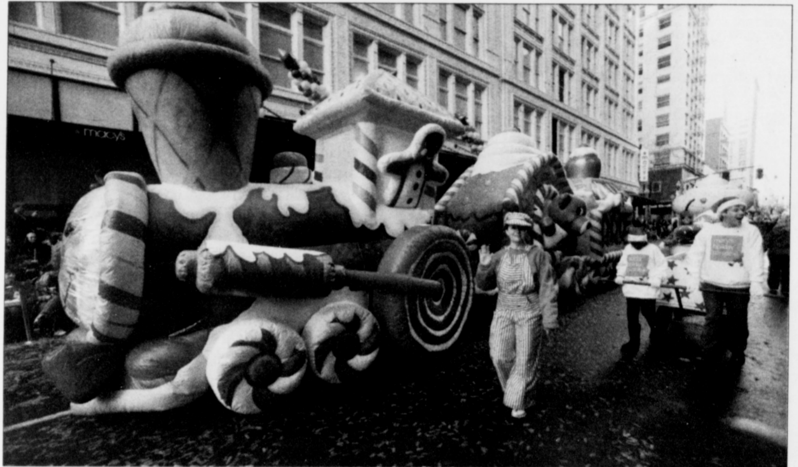
The Macy's Holiday Parade is a Portland tradition that will once again delight young and old when the annual event gets underway on Friday, Nov. 26, the day after Thanksgiving, starting at 9 a.m.

5132 NE MLK Blvd. (503) 284-2277 1724 NE Broadway (503) 288-8845