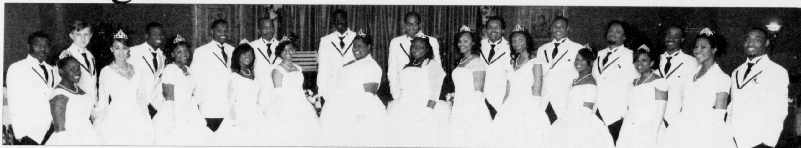
The Class of 2010 Les Femmes Debutantes and their gentlemen escorts.

CareOregon wants to transform health care.