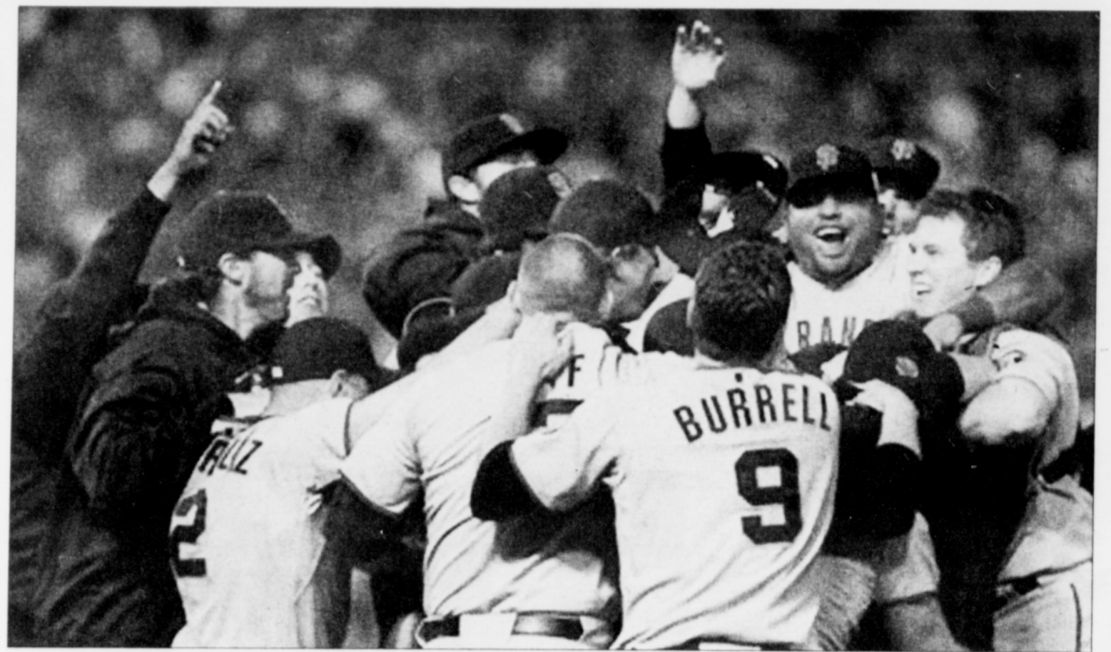
San Francisco Giants' celebrate after winning baseball's World Series against the Texas Rangers Monday in Arlington, Texas.