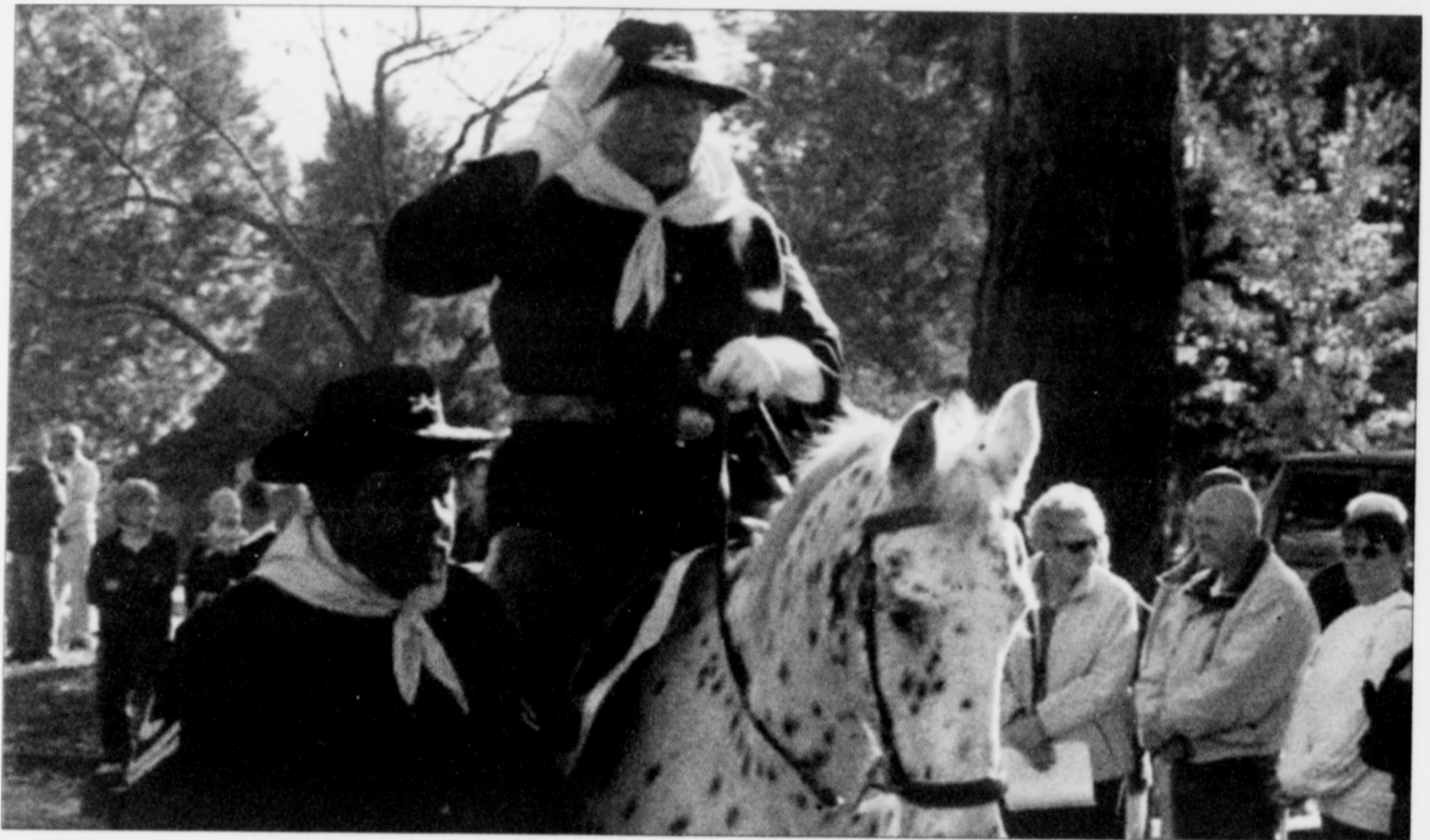
Buffalo Soldiers marching in the Veterans Parade at Fort Vancouver.