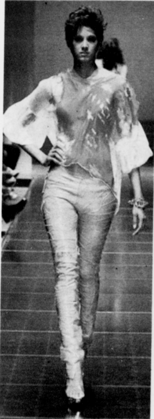
Portland Fashion Week brings a spring summer collection from Gordana-Spring.