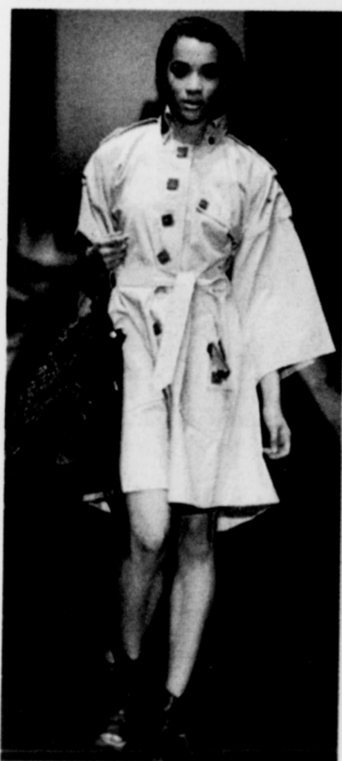
A spring/summer 2011 collection by Ms. Wood.

From formal wear to fun wear, the models looked fly. There were also asymmetrical as well as an assortment of fabric lengths fused it all together. There were distinguished and dapper men who donned neckties. There was also the use of belts and old school bob hair styles. Mini-skirts and metals also made an entrance. Nature also kept things fresh.