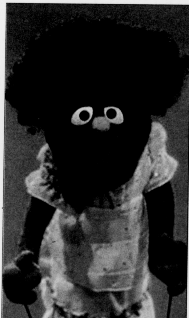
A brown muppet representing an African-American girl is shown during the taping of the 'I Love My Hair,' video for the children's program, 'Sesame Street.'