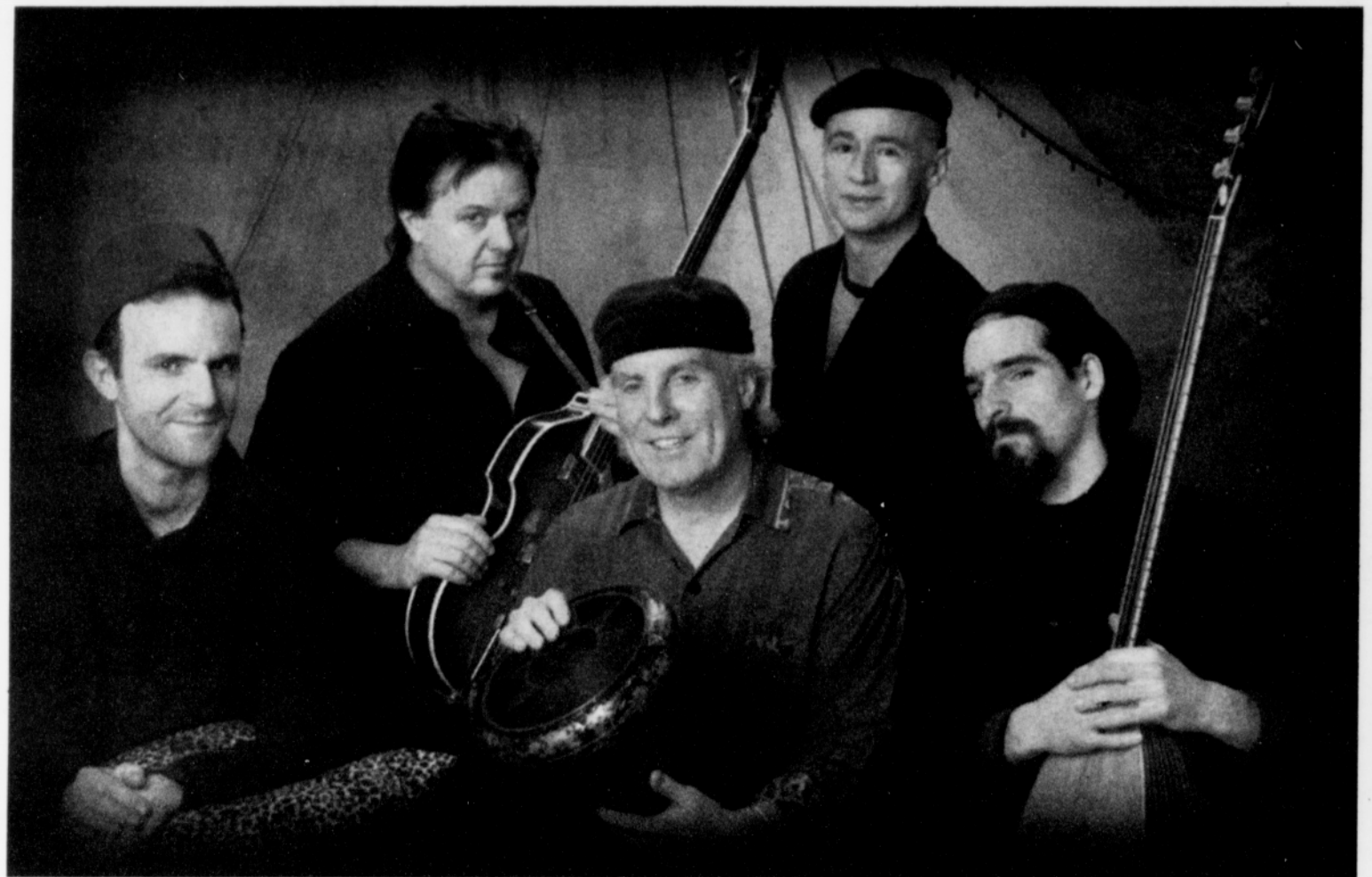
The dance band Brothers of the Baladi perform Sunday, Oct. 24 in a benefit for world peace and understanding.