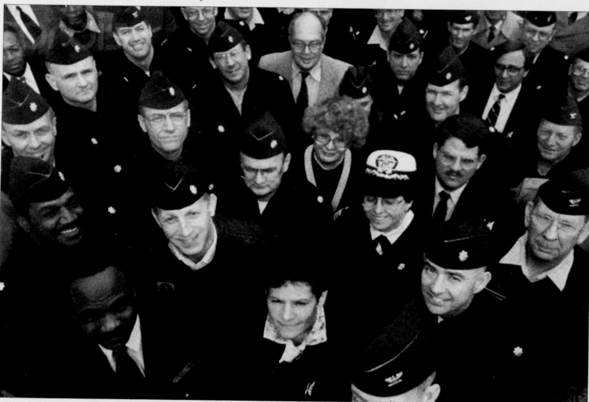
A military that looks more like the diverse population of the United States is reflected in the armed forces and civilian military staff from the Army War College in Carlisle, Penn.

Military 'can't go fast enough' to increase numbers