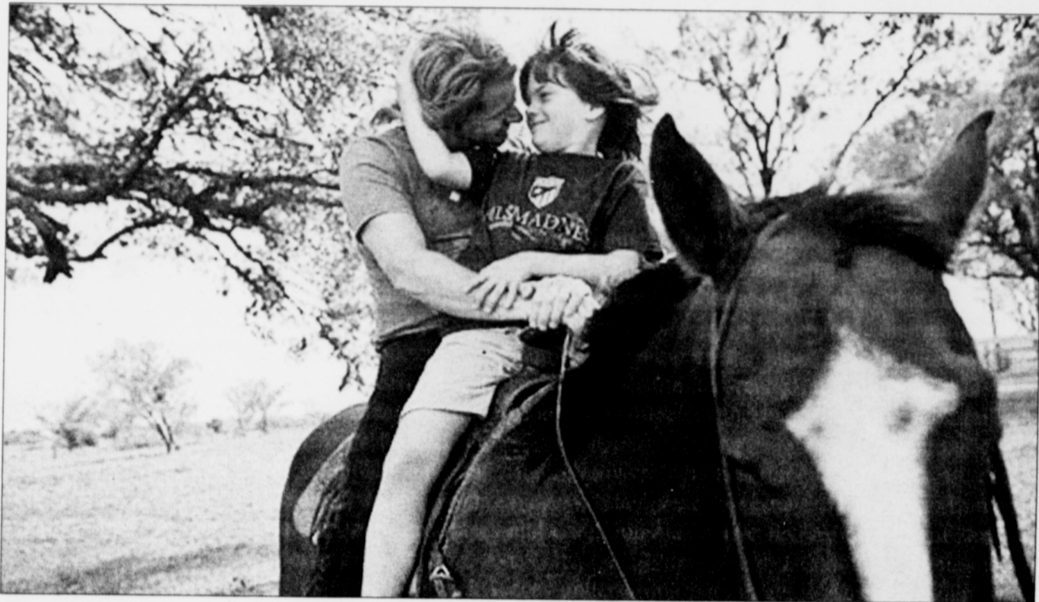
The documentary 'The Horse Boy,' follows a Texas couple and their autistic son as they trek on horseback through outer Mongolia.