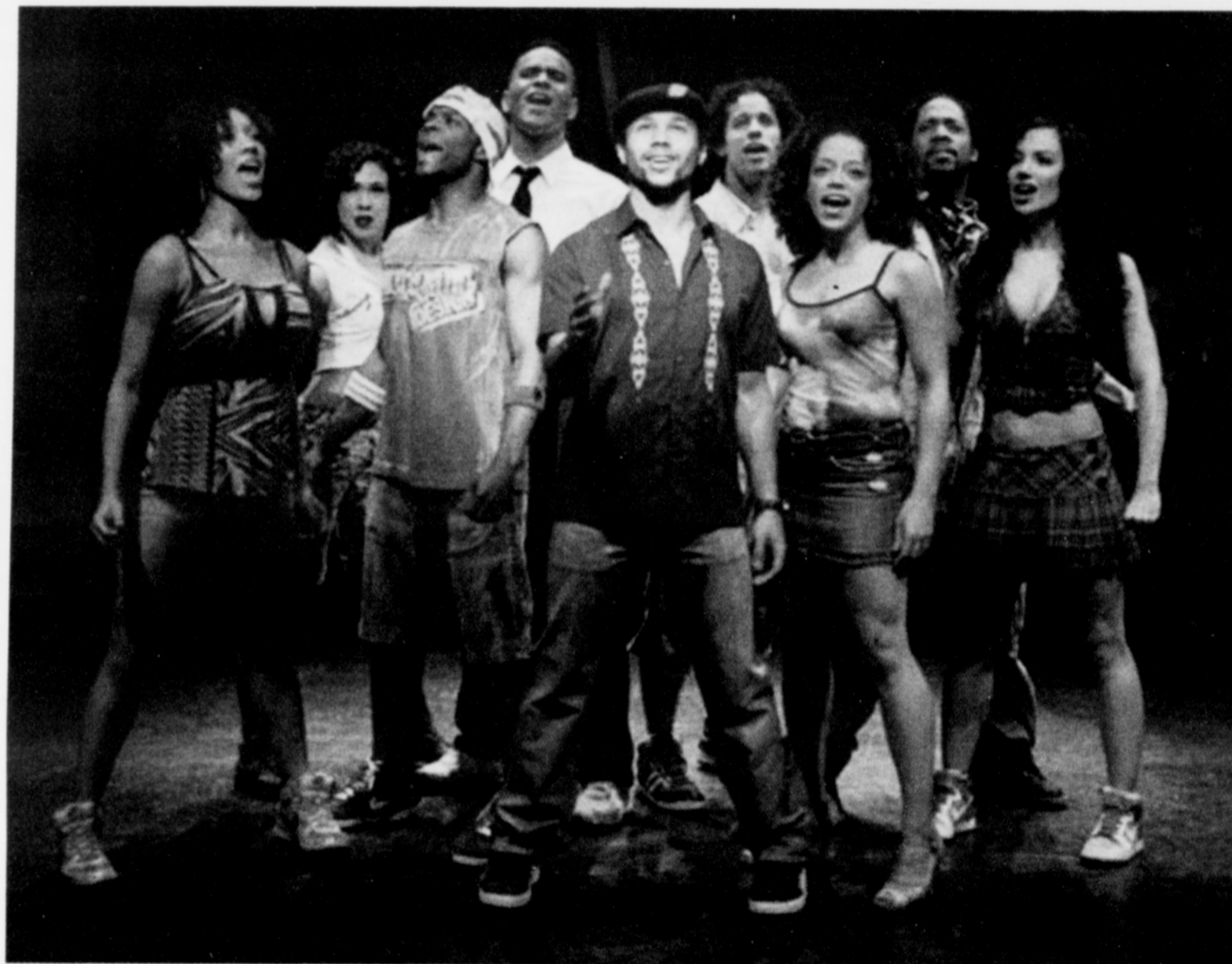
Performers in the musical 'In the Heights.' The Broadway Across America production comes to Portland Tuesday at Keller Auditorium.