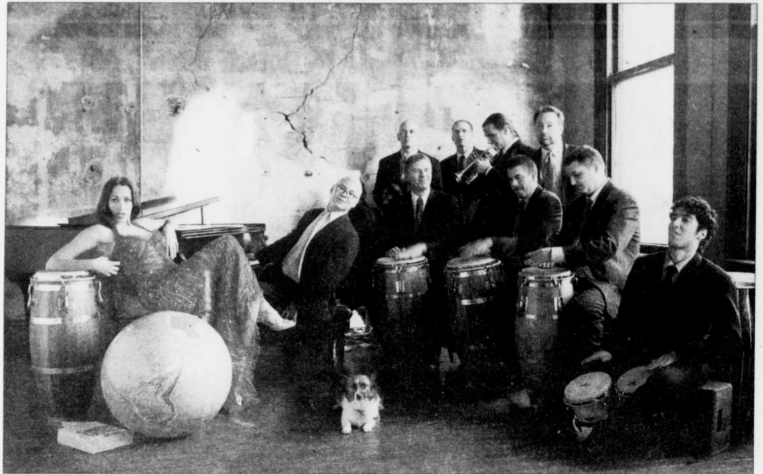
Pink Martini will perform in concert at Jefferson High School on Saturday, April 25 at 7:30 p.m. in a benefit to revive the school's once-thriving music program.

Enter the Rose City Music Festival! Developed as a fundraiser by the Jefferson High Alumni Association, the festival's mission is to raise enough money to bring a full program of music, graphic arts and drama back to the school, as well as the elementary and middle schools included in the